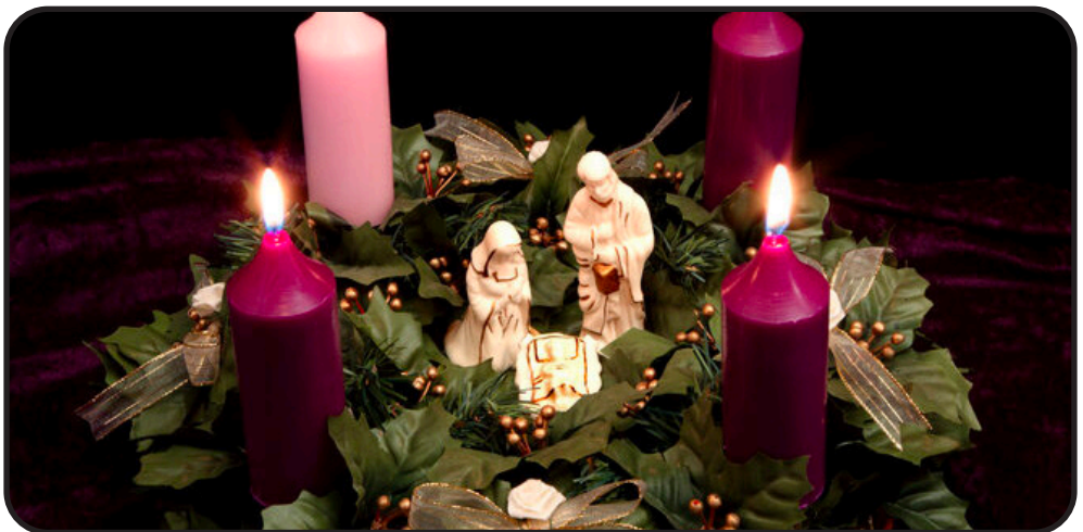
Catholic Digest, Advent Wreath with Nativity.

The actual light of the candles reminds us that Jesus comes into the darkness of our lives to bring newness, life, and hope. As the number of lit candles increase each Sunday bringing increasing levels of light into our homes, we are given a physical reminder of how we are drawing closer in our journey to our encounter with Jesus, our saviour. On Christmas day when we light all five candles, the dazzling brilliance of the fully lit wreath dramatically symbolises that Christ, the Light of the World, has arrived!