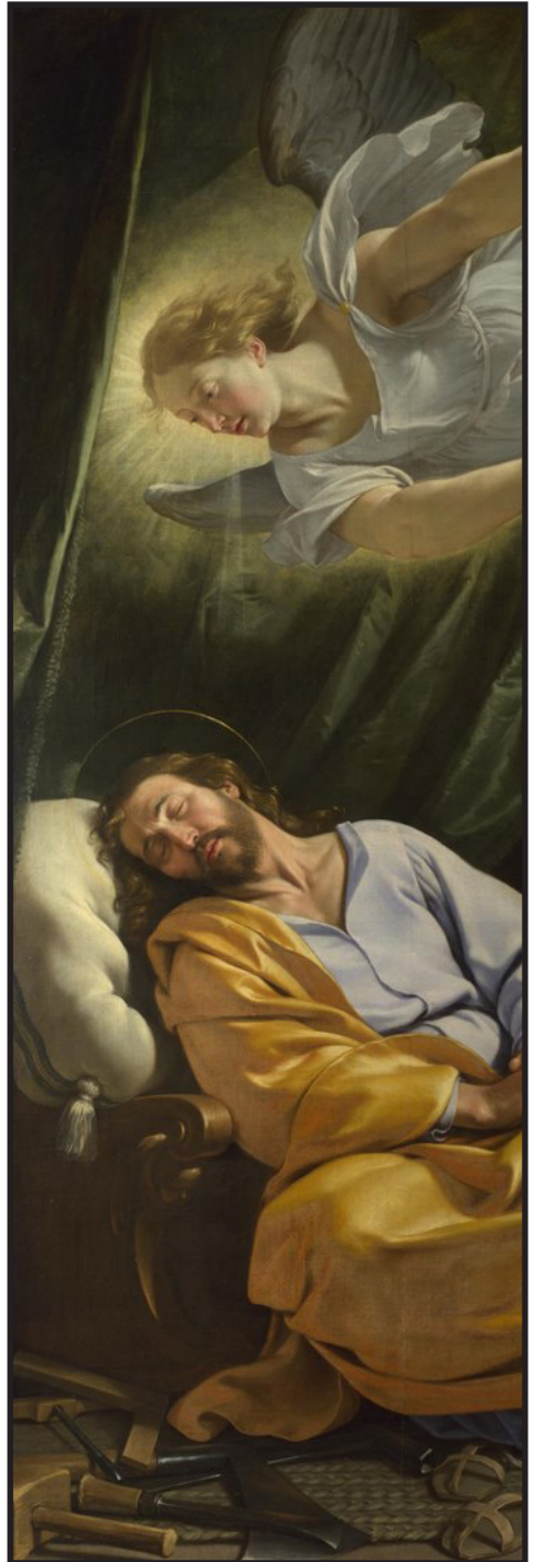
Philippe de Champaigne, The Dream of Saint Joseph , 1642-3.

O come, Adonai, Lord of might, Who to Thy tribes, on Sinai's height, In ancient times didst give the law In cloud and majesty and awe. Rejoice! Rejoice! Emmanuel Shall come to thee, O Israel.