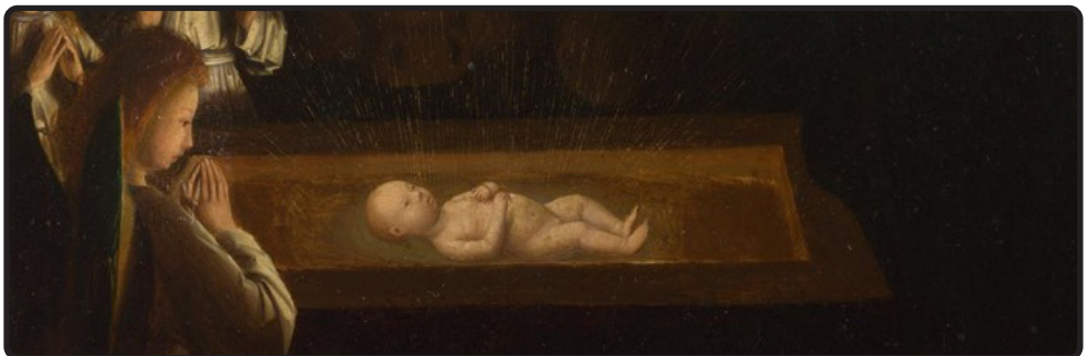
Geertgen tot Sint Jans, The Nativity at Night , possibly about 1490.

Read Mark 13:33-37. Jesus said to his disciples 'Be on guard, stay awake because you never know when the time will come. It is like a man travelling abroad: he has gone from home, and left his servants in charge, each with his own task; and he has told the door keeper to stay awake. So stay awake, because you do not know when the master of the house is coming, evening, midnight, cockcrow, dawn; if he comes unexpectedly, he must not find you asleep. And what I say to you I say to all: Stay Awake!