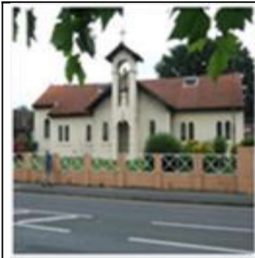
St. Theresa of the Child Jesus Totton