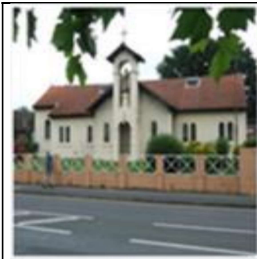
St. Theresa of the Child Jesus Totton